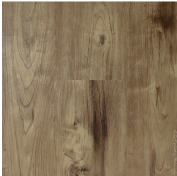
Chateau (CL-32) Aegis (CL-37)