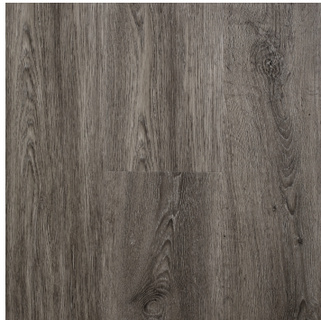
Dover Grey (CL-34) Vallation (CL-39)