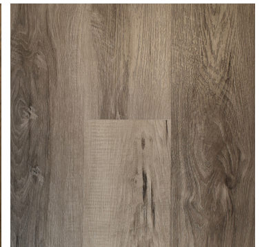
Seattle Skies (FT-18)