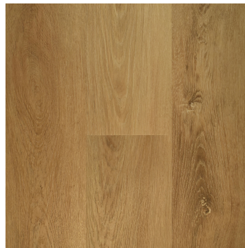
Western Oak (FT-11)