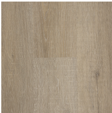
Soft Tan (FT-10)