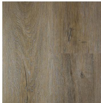
Coastal Landscape (FT-12)