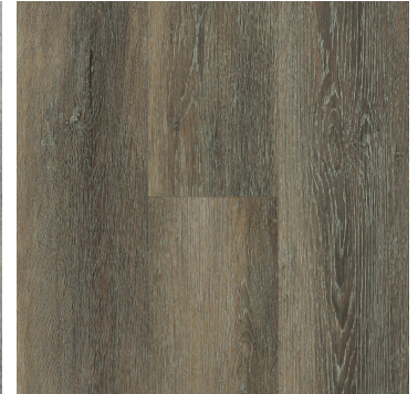
Falcon Oak (MR11-94)