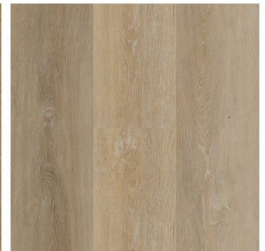
Sandy Shore (MR11-98)