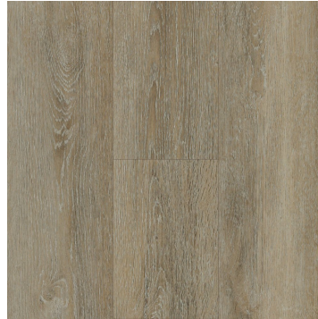
Shoreline Oak (MR11-92)