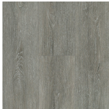
Slate Oak (MR11-96)