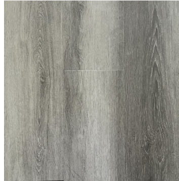
Calm Oak (MR11-93)