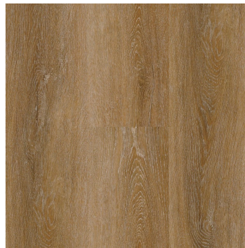
Autumn Sunrise (MR11-97)