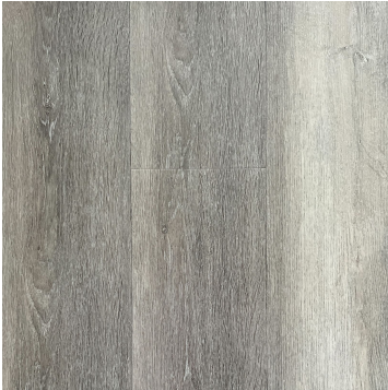
Cobblestone Oak (MR11-91)